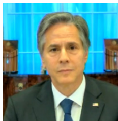
Antony J. Blinken