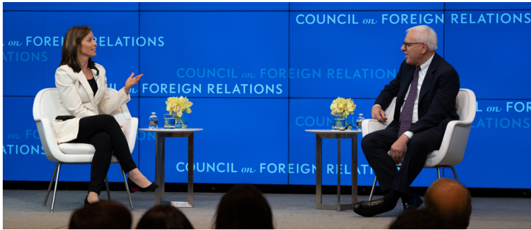
Adena Friedman, President and CEO of Nasdaq, in conversation with CFR Chairman David M. Rubenstein in the opening session of the 2022 Corporate Conference.