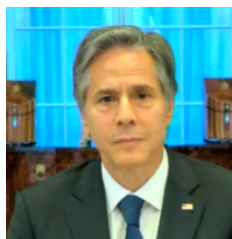
Antony J. Blinken