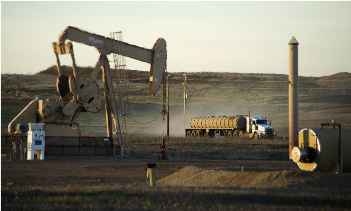
A service truck drives past an oil well on the Fort Berthold Indian Reservation in North Dakota.

Maurice R. Greenberg Center for Geoeconomic Studies