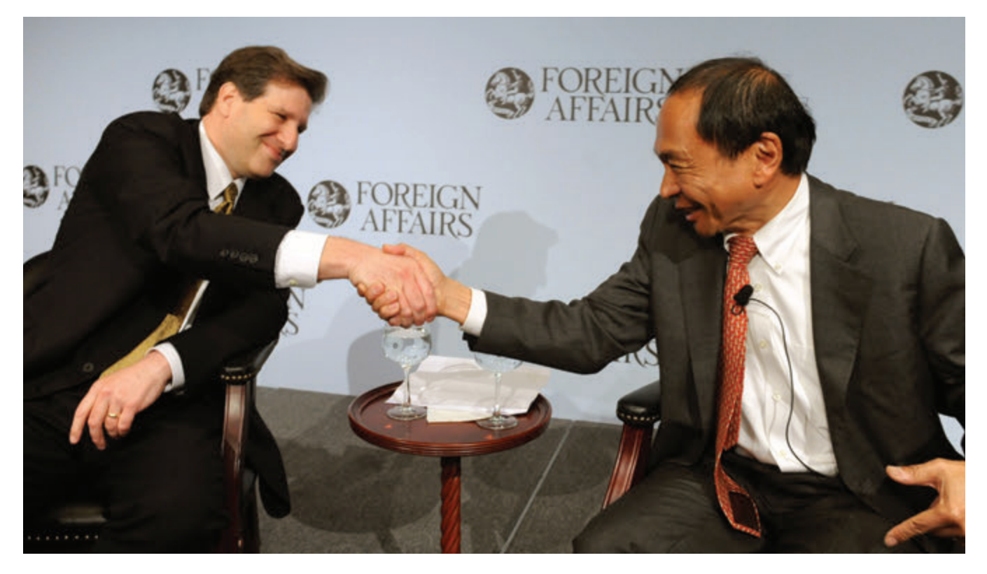
Foreign Affairs Editor Gideon Rose with renowned political scientist Francis Fukuyama at the Foreign Affairs LIVE event "The Future of History."

3.2 million unique visitors and 11 million page views. More than 175,000 readers follow Foreign Affairs on social media (including Twitter and Facebook), more than 100,000 subscribe to our <u>free weekly enewsletter</u>, and our Foreign Affairs <u>videos on YouTube</u> have been viewed more than 150,000 times. We will continue to embrace the digital revolution in the year to come and are currently developing an app for the iPad.