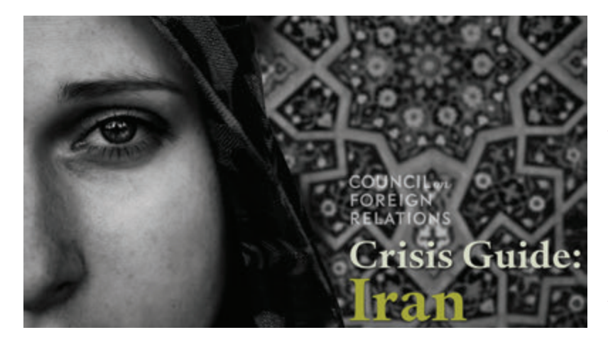
This year, the institution's presence in social media developed significantly. Fans on Facebook grew by more than 80 percent, and Twitter followers increased nearly 40 percent, propelled in part by the twenty-five fellows now active in that space.

This year, the institution's presence in social media developed significantly. Fans on <u>Facebook</u> grew by more than 80 percent as a result of the enhanced experience on our institutional page, while <u>Twitter</u> followers increased nearly 40 percent, propelled in part by the twenty-five fellows now active in that space.